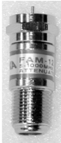
12 dB Pad